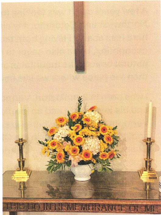
June 9, flowers by Billie Fitch